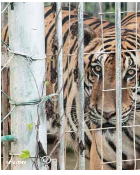
Above: a caged tiger in Laos