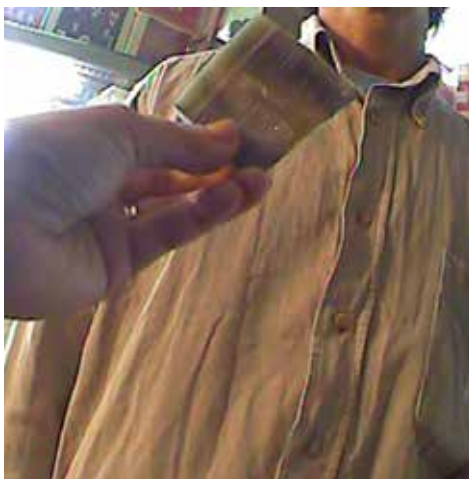
Undercover camera showing sale of rhino horn in Hanoi 2011

Clearly, Vietnam's failure to enforce its CITES implementing legislation and prosecute individuals involved in the illegal rhino horn trade is diminishing the effectiveness of CITES.