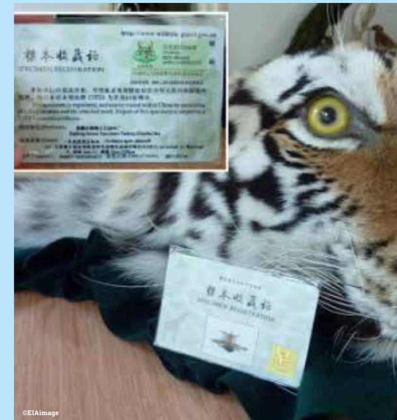
China allows the skins of captive bred tigers to be turned into rugs and taxidermy items. The taxidermist offering this skin to investigators explained how the licensing system could be used to launder illegally sourced skins

There is an obsession with breeding white tigers in captivity accompanied by spurious claims about it being in the interest of the "species" conservation. True white tigers are Bengal tigers ( Panthera tigris ), bred to display a recessive gene. There is no conservation value in breeding them, nor is there any conservation value in breeding them with Siberian tigers.