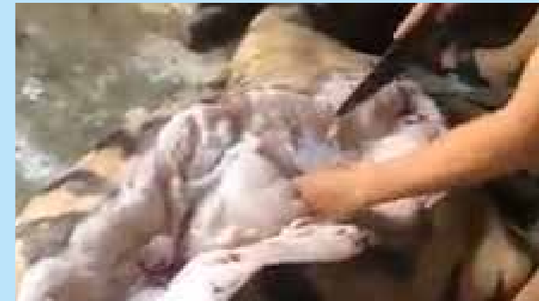
... skinned and butchered ...