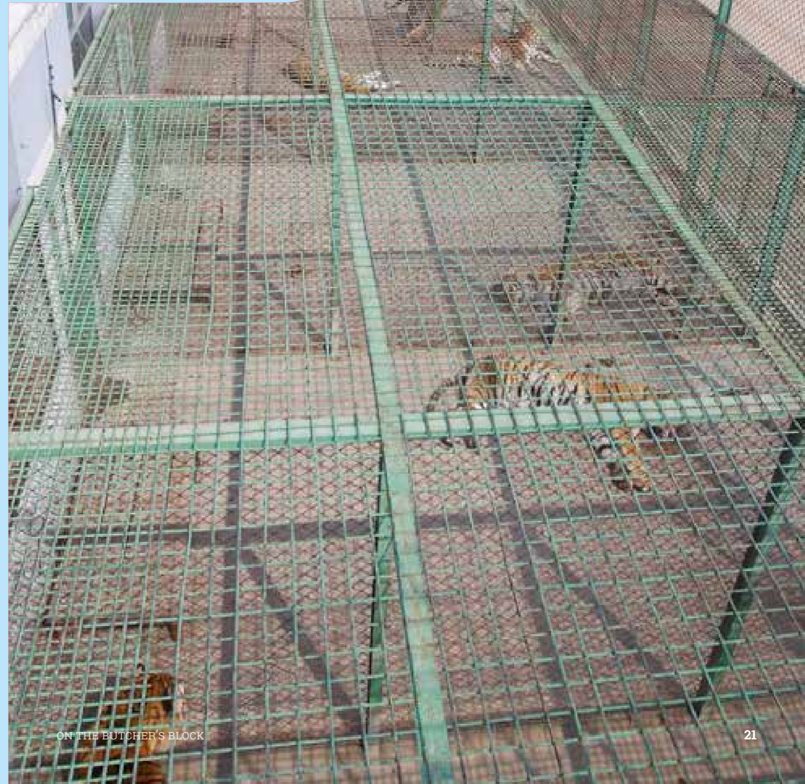
Far right: captive tigers at one of China's largest speed-breeding farms

News around the announcement on the 24 February 2020 suggests there is still scope for further revisions to China's Wildlife Protection Law and other regulations. Our recommendations propose amendments that would lead to an end to the use of captive-bred tigers. 82