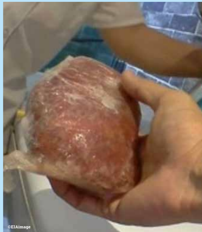
Tiger meat is consumed as an exotic delicacy

In September 2019, a tiger head and tiger meat was seized alongside bear paws, porcupines, giant salamander and other wildlife from a freezer at a Zhejiang hotel. The hotel owner had a sideline in selling exotic meats and had sourced the tiger from contacts in zoos; the tiger in question had reportedly died of pneumonia in 2016. 87