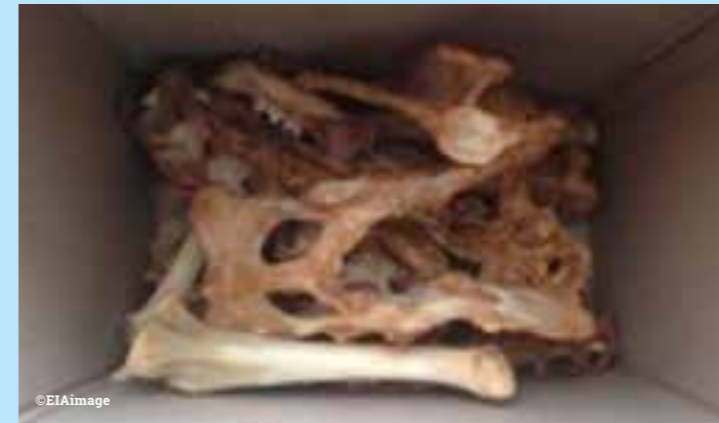
Above and below: tiger bones and skull for sale at retail premises, 2016

户再大，不向我拿货，也等于零，客户再小，经常 我拿货，就是我的VIP。市场没有统一价，您总能 到比我们便宜的，也能找到比我们贵的，市场竞争 热化的大环境下，各行各业都不存在暴利，认准 靠谱的合作伙伴就可以了。不要比价比一圈，谁都 自信。最后，您永远成为不了谁家的VIP。