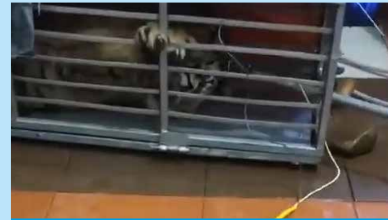
Captive tigers are electrocuted ...

There is clearly more that authorities in Vietnam can do to investigate the footprint of Vietnamese tiger traders in the region and further afield, including following the money associated with those in the trade that they have already arrested and convicted. Upcoming CITES missions to Vietnam presents an opportunity to address the lack of enforcement in Nghe An Province and the need to further restrict who can keep and breed tigers.