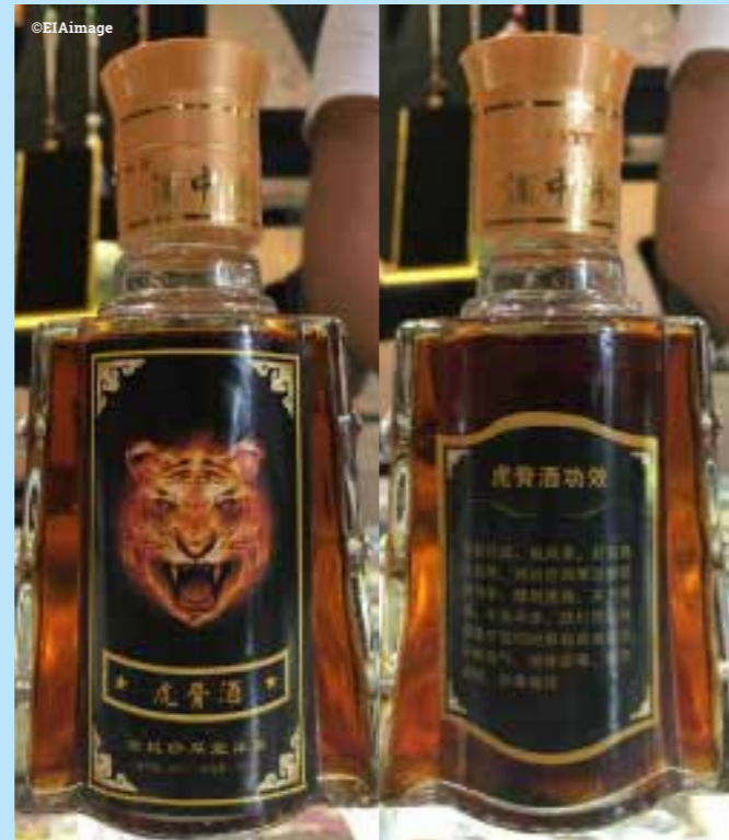
Tiger bone wine for sale in the Vientiane shop

Tiger bone and tiger bone wine being sold by this company are pictured right.