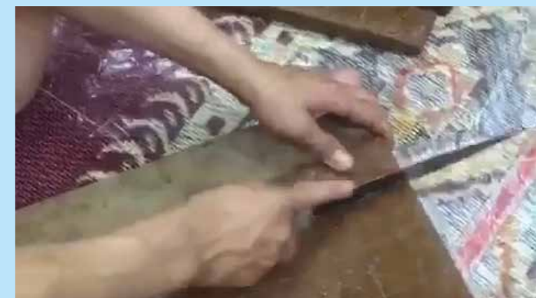
... to make tiger bone glue