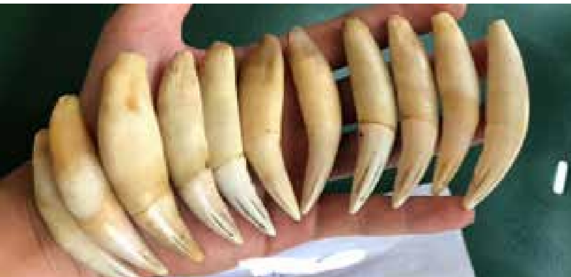
Left: Unworked tiger teeth for sale online from Vietnamese trader

The impact of continued demand, the failure to stop tiger farming and the increase in recorded incidents of trade in captive-bred tiger parts are among issues highlighted in two detailed and substantive reviews prepared for the CITES Parties by a trade expert in the IUCN Cat Specialist Group in 2014 23 and 2019. 24 The reviews documented both shortcomings and good practice across Asian big cat range and consumer states in relation to legislation, enforcement and demand reduction.