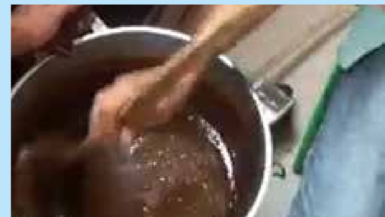
... their bones boiled for three days ...