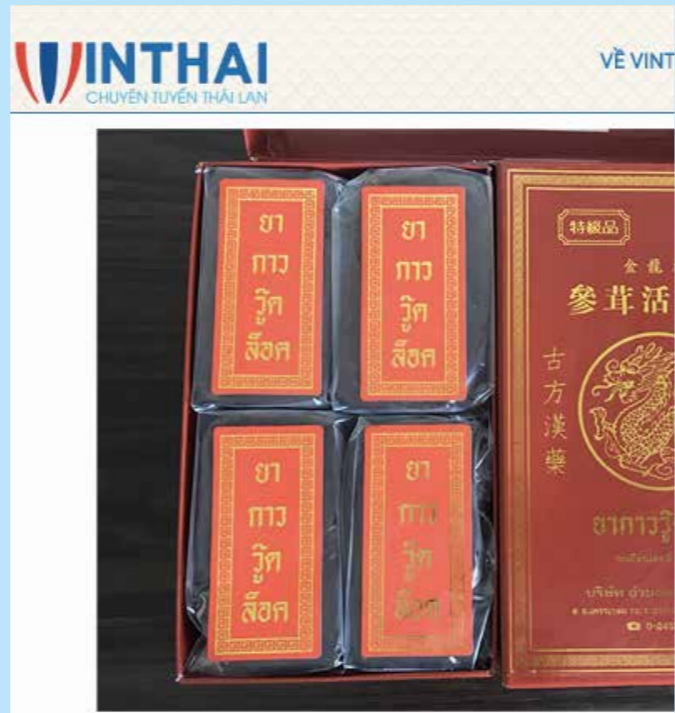
Website vinthai.net advertises “Thailand tiger bone glue”

In 2002, it was reported 39 that the company confirmed it had been legally allowed to manufacture tiger bone products under the Thai Food and Drug Administration and had in fact sourced tiger bone from Myanmar, which would have been in contravention of CITES. It went on to say that it would recall all tiger bone products (it was making nine different products at the time) and would replace tiger bone with a herbal alternative in future production.