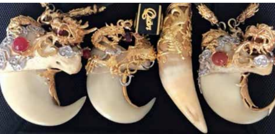
Below left: Teeth and claws are fashioned into expensive jewellery worn as a status symbol