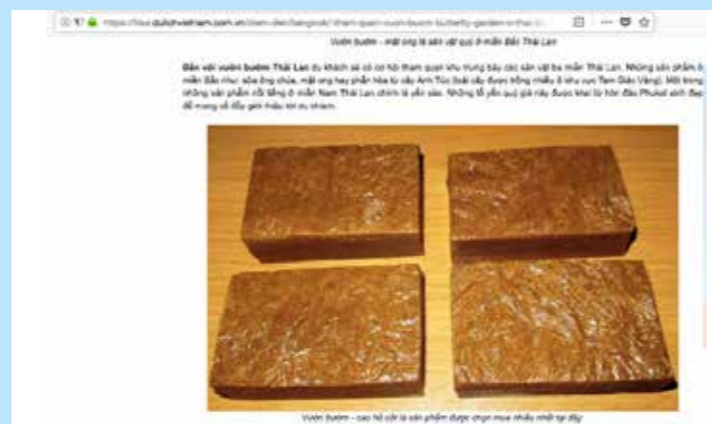
Tourism website touting the availability of tiger bone glue