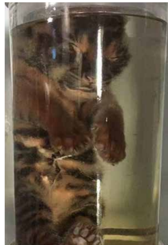
Left: Trade in dead tiger cubs is thriving as a result of unregulated breeding, poor husbandry and inbreeding, causing high infant mortality. Cubs are put into jars of liquor or wine and mixed with other ingredients such as snakes, scorpions, pangolins, bear paws and ginseng. Popular among Vietnamese consumers.