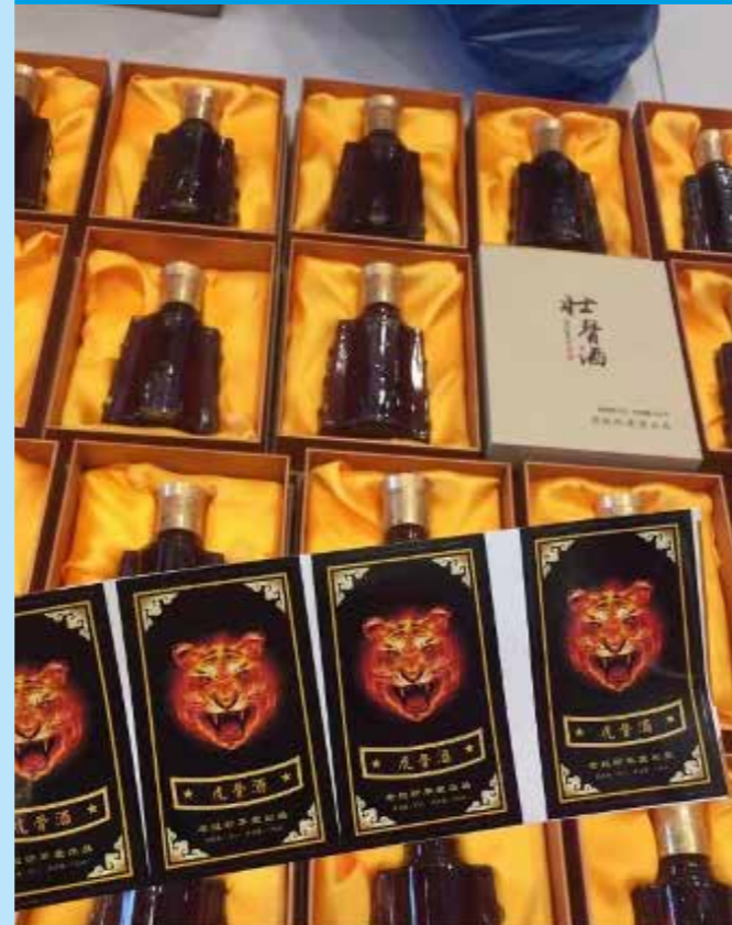
Tiger bone wine for sale on the company's social media account

户再大，不向我拿货，也等于零，客户再小，经常 我拿货，就是我的VIP。市场没有统一价，您总能 到比我们便宜的，也能找到比我们贵的，市场竞争 热化的大环境下，各行各业都不存在暴利，认准 靠谱的合作伙伴就可以了。不要比价比一圈，谁都 自信。最后，您永远成为不了谁家的VIP。