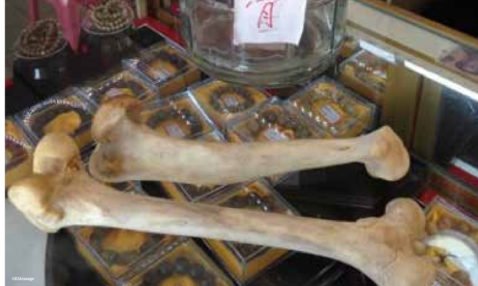
Above: Tiger bone is used in traditional Chinese medicine to treat rheumatism and arthritis