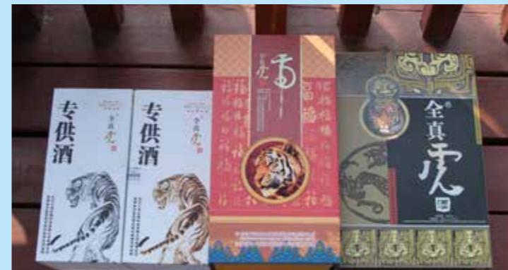
Sanhong's "Real Tiger Wine", made with captive tiger bones, which they claim they have permission to make, China