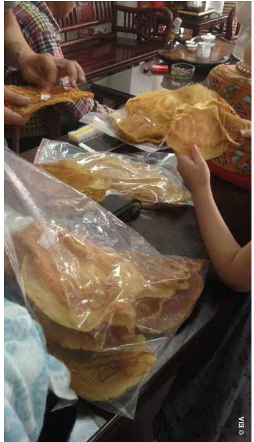
Above: Totoaba maw (dried swim bladders) for sale in China, the main market driving the trade

A little over two weeks later, CITES lifted the sanctions against Mexico after the Government met with officials and agreed a plan to protect both the vaquita and totoaba from illegal fishing.