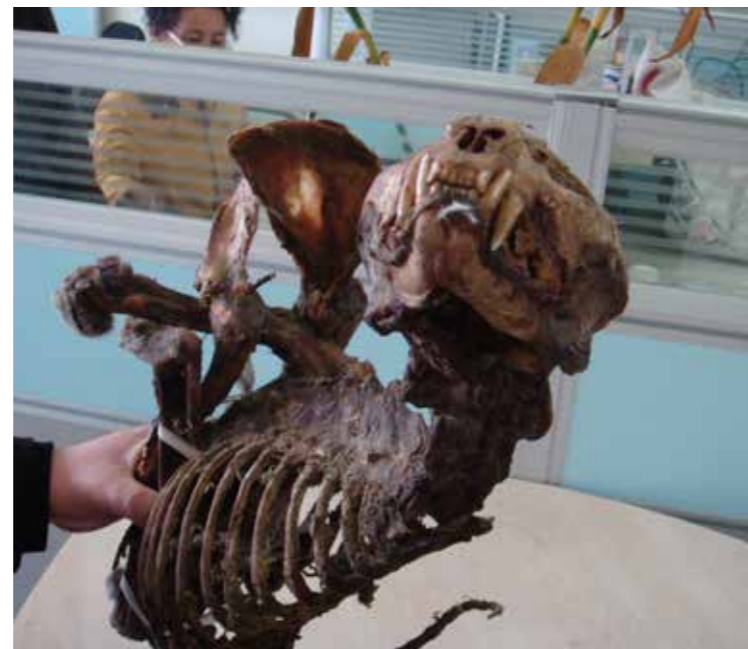
Clouded leopard skeleton offered as leopard bone to EIA investigators in 2008