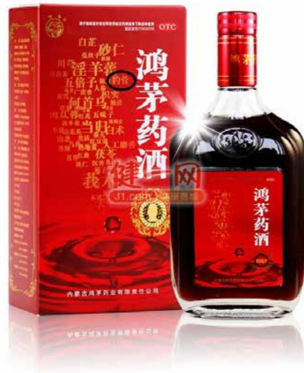
Hongmao Medicinal Wine. The characters for 'leopard bone' (豹骨) are displayed on the product packaging (circled in black).

In 2008, the director of the company offered investigators the skeleton of a clouded leopard, claiming it was leopard. The skeleton still had some tissue and fur attached, indicating that it was recently killed and not from an old stockpile. During the meeting, it was suggested to EIA that more leopard bone was available.