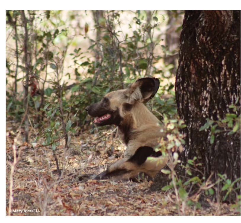
Above: An estimated one-third of the global population of African wild dogs is found in the Selous.

Despite these serious concerns and compelling recommendations to abandon the project, the Government of Tanzania has accelerated the construction of the dam. Construction is now more than halfway complete and the Government has announced its intention to commence filling the reservoir in November 2021.<sup>11</sup>