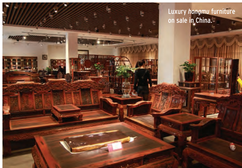
Luxury hongmu furniture on sale in China.

As a consequence a series of bilateral meetings between forestry officials from China and Myanmar have taken place as a precursor to a possible joint timber verification scheme between the two countries. While such dialogue is welcome in bringing together the two sides to exchange views and information, tangible outcomes such as China agreeing to observe Myanmar's log export ban remain elusive. In reality, a fundamental difference of opinion appears to exist between the two countries, with Myanmar seeking its neighbour's help to stop the flow of illegal timber across the border while China seeks to legalise the trade. For instance, at one such meeting in Myitkyina, Kachin State, in June 2015 the Kachin Forest Department wanted to call the event "Prevention of Illegal Trade in Forest Resources" but this was changed to "Promotion of Legal Trade in Forest Resources". 56