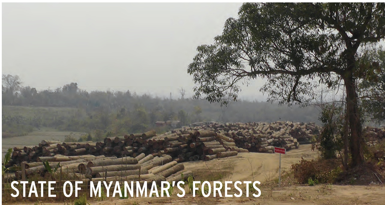
ABOVE: Myanmar Timber Enterprise log depot, Sagaing Division.

The Greater Mekong Sub-region (Myanmar, Laos, Vietnam, Thailand, Cambodia and south China) has some of the largest expanses of natural forest in the world and is widely recognised as a global priority for environmental conservation. 1 Yet the region is in the midst of an environmental crisis. Projected forest loss by 2030 is predicted to reach 30 million hectares, with the region labelled as one of 10 global “deforestation fronts”. 2 Major causes of forest loss are the expansion of agribusinesses, illegal logging and unregulated infrastructure development. In many cases these threats are being driven by weak governance, absence of rule of law and corruption within government agencies mandated to protect the forests. 3