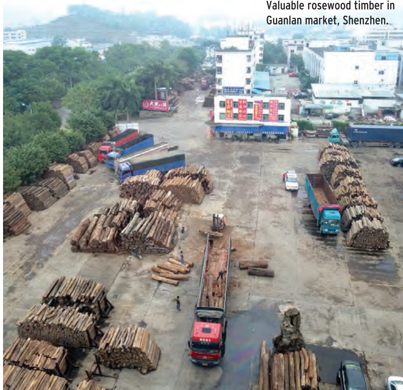
Valuable rosewood timber in Guanlan market, Shenzhen.

Senior forestry officials in Myanmar have publicly expressed their exasperation over the lack of assistance from China in combating the illegal cross-border trade. In November 2014, a MOECFA official said: "I have requested the minister of the State Forestry Administration and the regional government of Yunnan Province to ban the illegal import of Myanmar's timber. Although the central Government of China does not seem to support the illicit trade, the Yunnan administration prioritises its peoples' employment and the supply of raw materials." 57 In May 2015, the deputy director-general of the Forest Department told the media: "Every time I visit China they pledge to do what they can. But we've seen no effective action." 58