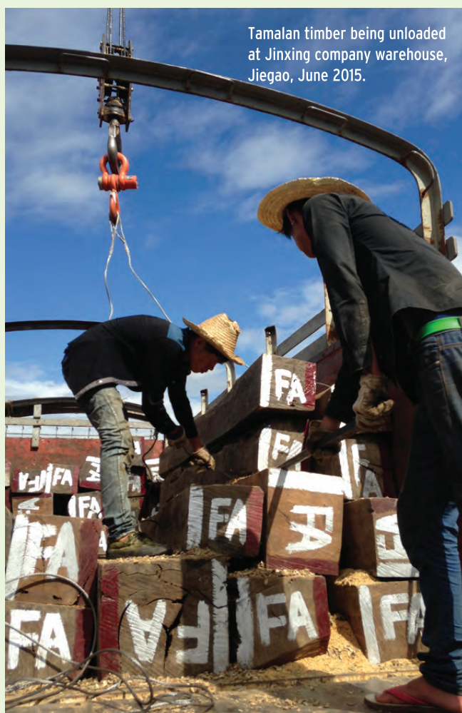
Tamalan timber being unloaded at Jinxing company warehouse, Jiegao, June 2015.

Chinese customs data shows that Jinxing was the biggest importer of rosewood logs from Myanmar in 2014, with a total volume of 34,274 tonnes. 40