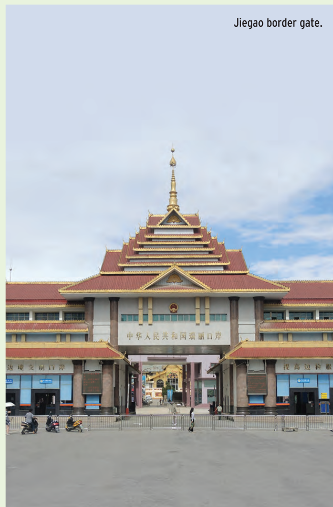
Jiegao border gate.