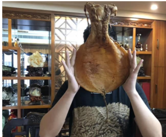
Above: Totoaba maws are highly prized. Organised criminal networks are stripping Mexico's waters of totoaba to supply a maw demand in China and elsewhere.

The number of totoaba maws found on Facebook is lower than previous research indicates; however, the number available on WeChat has significantly increased. In 2022, the number of totoaba maw tripled and the volume increased six-fold compared to 2021. In 2023, the number and volume of totoaba maw were more than five times higher than in 2022 on WeChat (see Figure 1). This increase and trajectory are alarming.