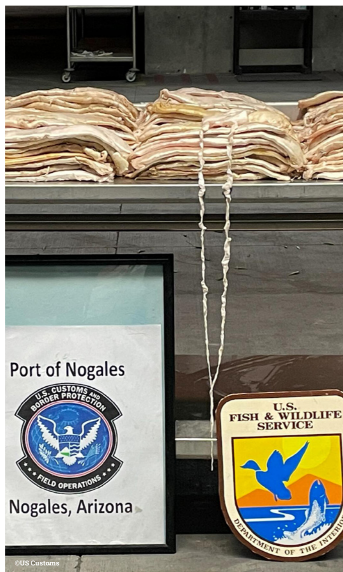
Above: Fresh totoaba maws seized in the USA, June 2023.

While China remains the main market for totoaba maws, seizure records indicate emerging markets in Thailand and Vietnam. Given the ongoing availability of totoaba maws online in China, there is clearly an inadequate focus on enforcement efforts and a requirement for a renewed commitment to act from all countries.