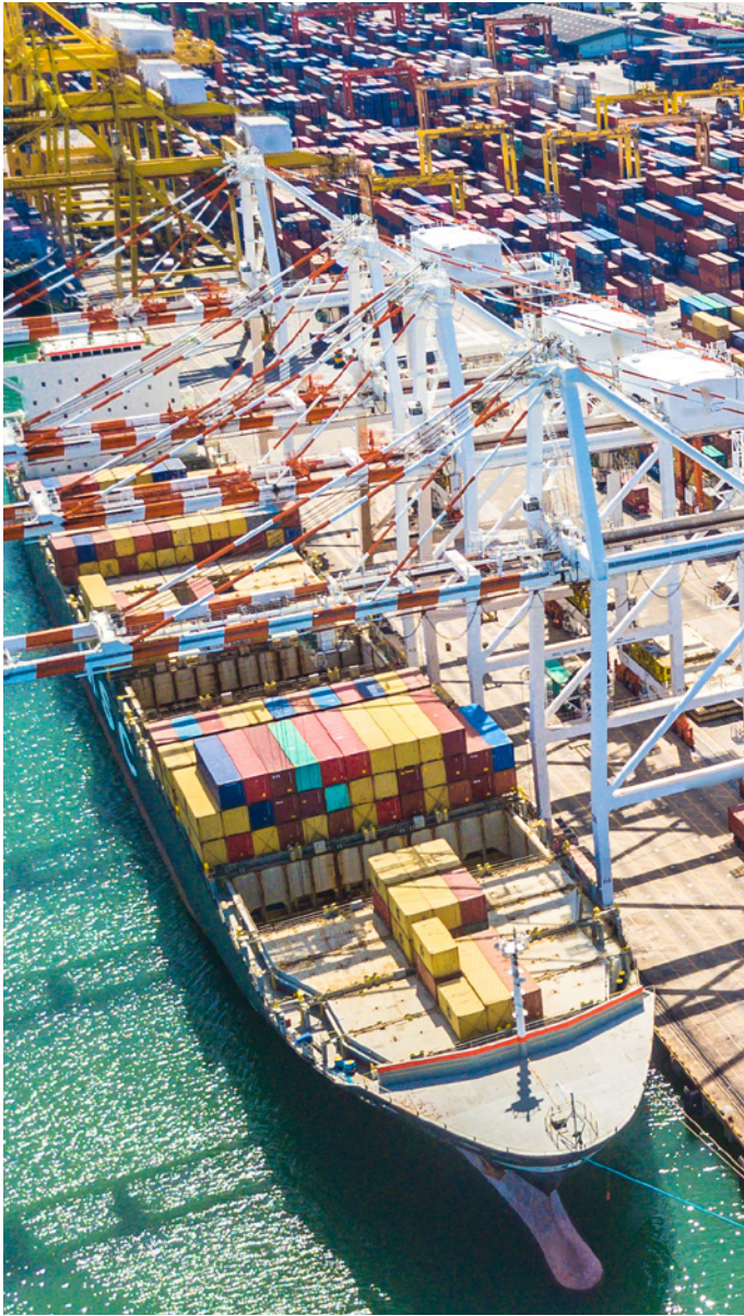
Right: Singapore port via which large quantities of illicit teak are shipped to the US

For the 2022 period alone, during which MTE was holding monthly auctions, data from UN Comtrade reports that $13.2 million worth of Myanmar teak was imported into the US in direct defiance of sanctions. 13 But the true loss of value of these forests cannot be quantified in monetary terms because of the loss of ecosystem services that teak trees provide. Forests also act as the last line of defence to the people of Myanmar, providing medicines and foods as well as areas of cover in which they can hide from the military.