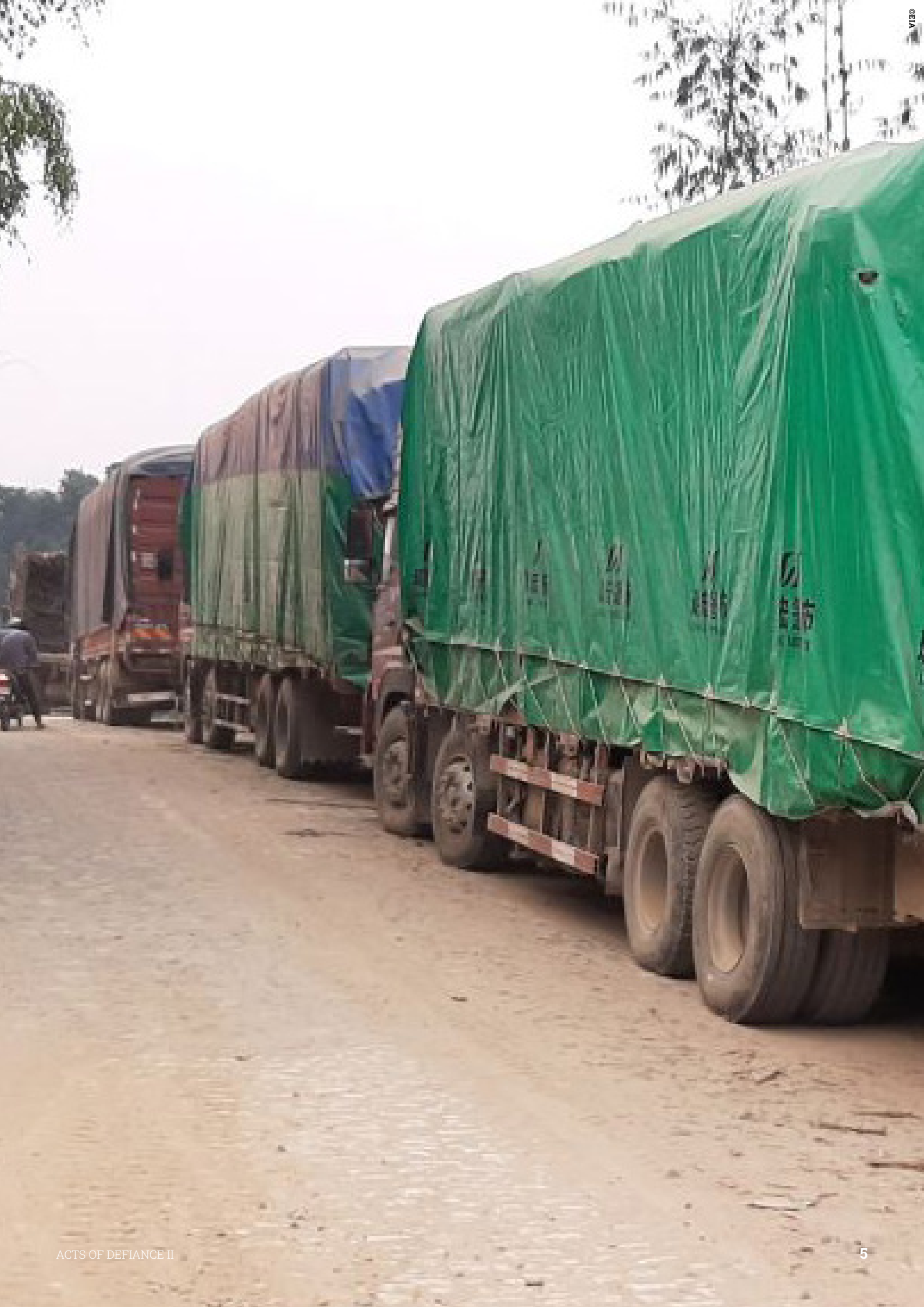
Right: Trade in Myanmar teak continues to flow to international markets