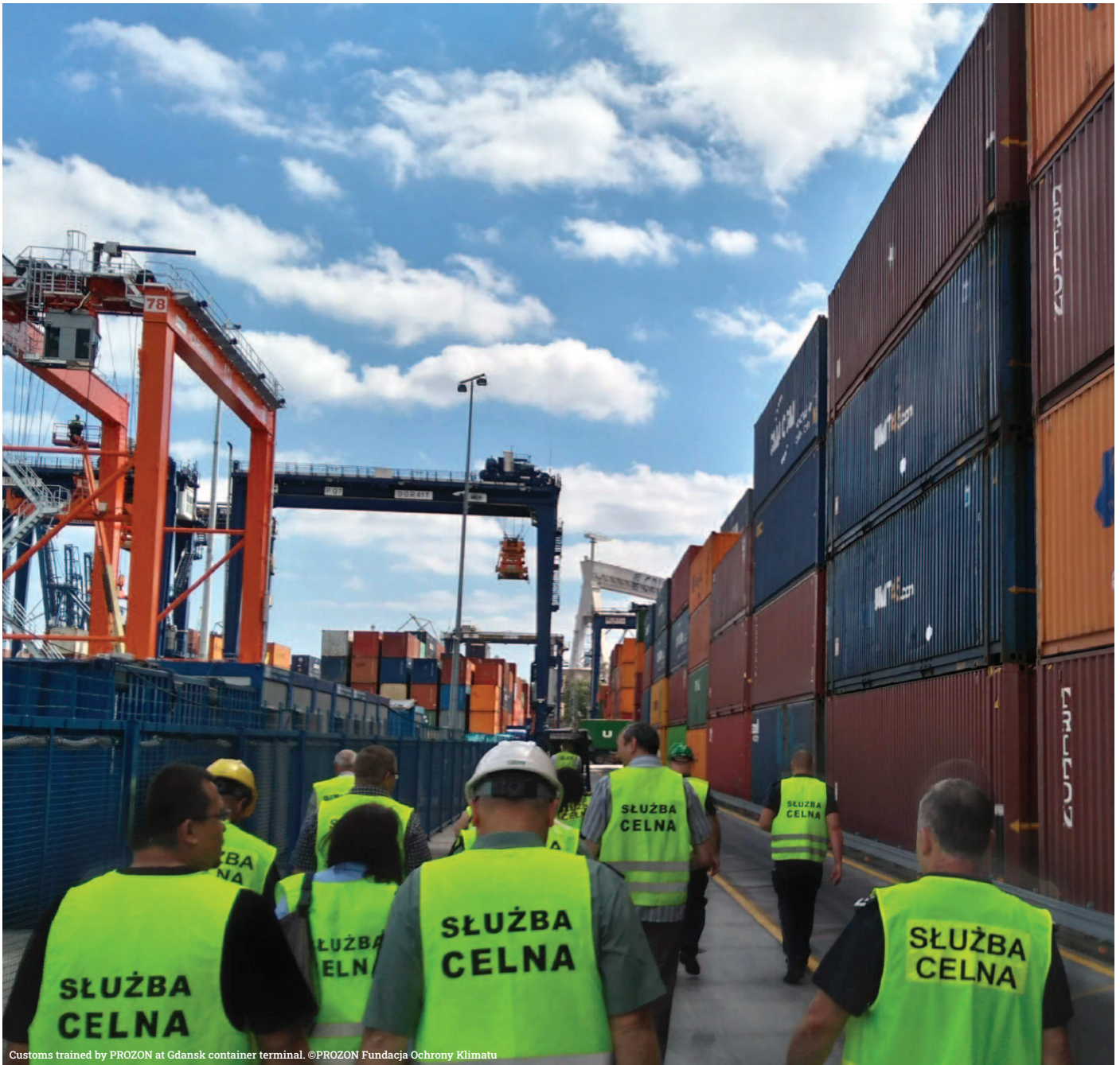
Customs trained by PROZON at Gdansk container terminal.