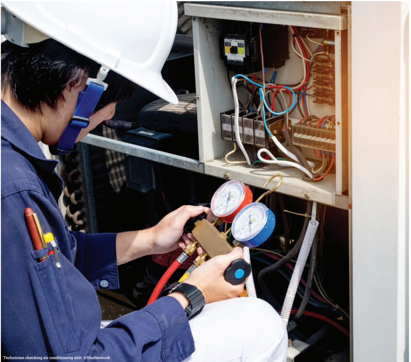
Technician checking air conditioning unit.