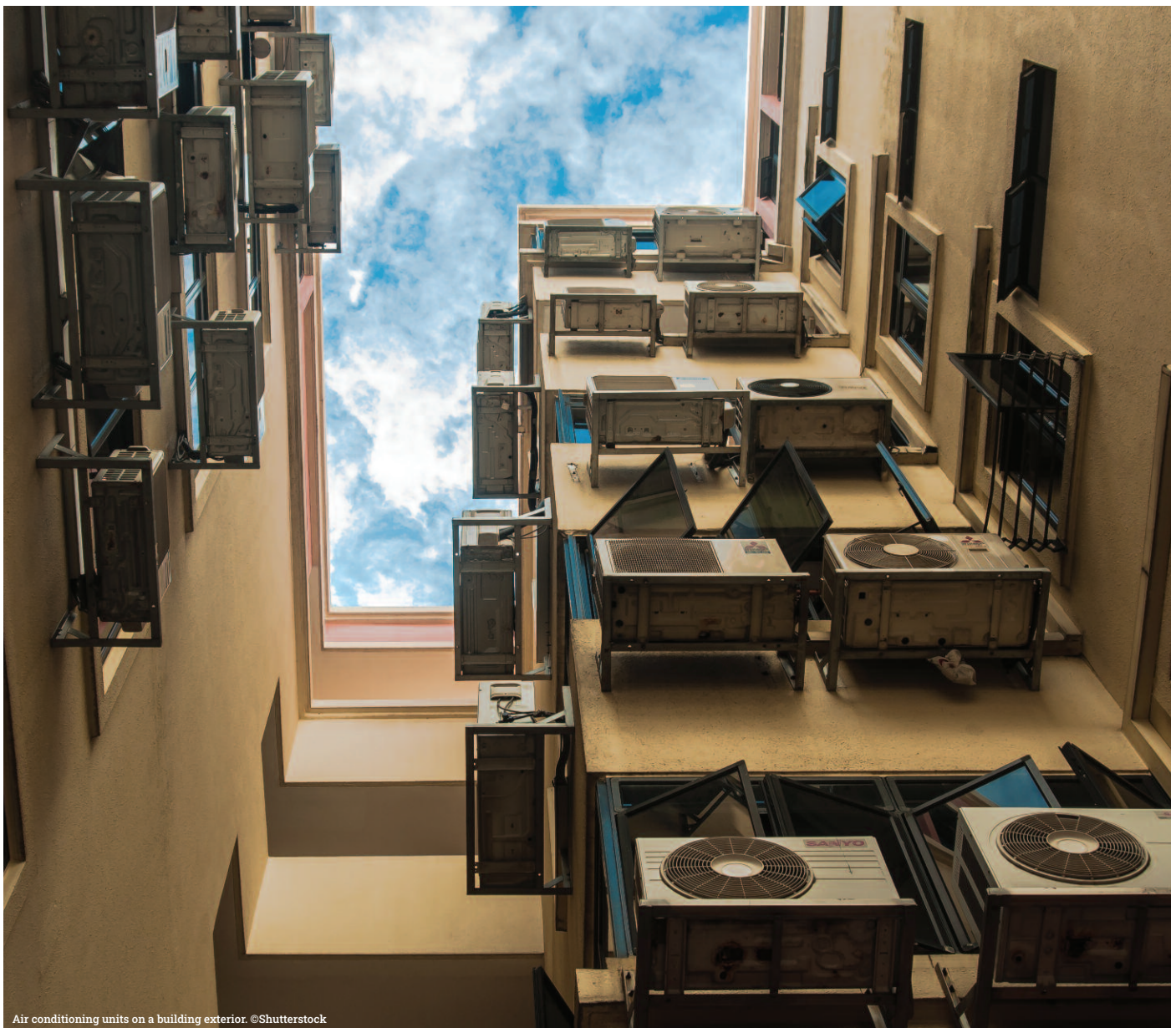
Air conditioning units on a building exterior.

Split Air-Conditioning and Heat Pump Equipment: prohibition on F-gases GWP \geq 150 in smaller (up to and including 12 kW) split air-to-water systems from 2027, on smaller split air-to-air systems from 2029 and on all F-gases in smaller split systems from 2035; prohibitions on F-gases GWP \geq 750 in larger (above 12 kW) split systems from 2029 and on F-gases GWP \geq 150 in larger systems from 2033. 14