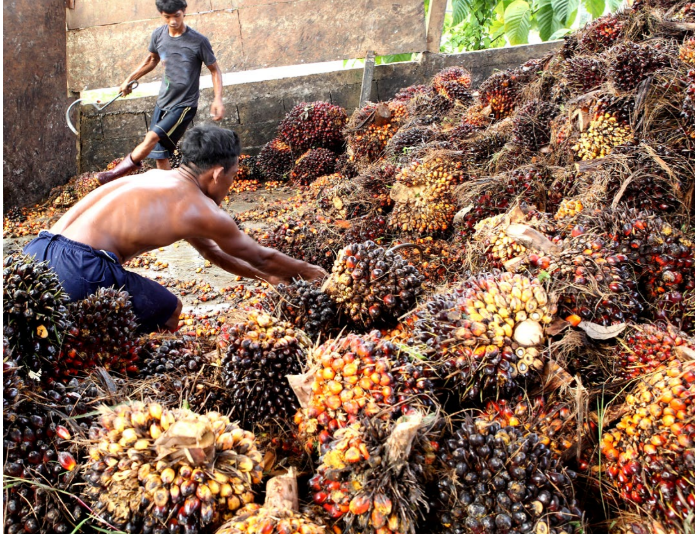
Above: There have been multiple allegations of forced labour by palm oil companies over the past year