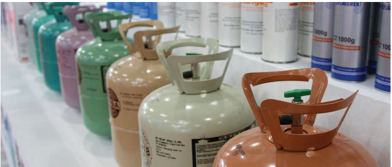
Fluorochemical manufacturing of HFCs and HFOs is linked to significant feedstock and byproduct emissions

This, coupled with the scale of ongoing emissions of ODS, clearly warrants a comprehensive re-examination of fluorochemical production processes and tighter controls over emissions of feedstocks, intermediates, by-products and the products themselves.