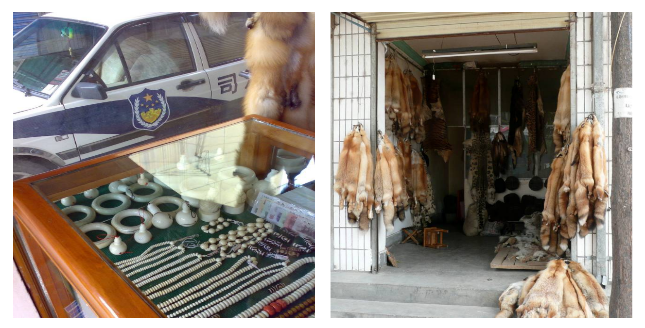
LEFT The illegal sale of uncertified ivory and Appendix 1 Asian big cat skins takes place in full view of enforcement officers along Beida Street, Linxia, Gansu, PRC, June 2008 © EIA RIGHT Genuine snow leopard skins are sold alongside fake tiger skins Linxia, Gansu, PRC, June 2008 © EIA

to the SFA, reiterating previous recommendations that authorities plan covert investigations with investigators of appropriate ethnicity.