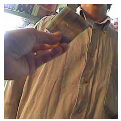
Undercover camera showing sale of rhino horn in Hanoi 2011

Clearly, Vietnam's failure to enforce its CITES implementing legislation and prosecute individuals involved in the illegal rhino horn trade is diminishing the effectiveness of CITES.